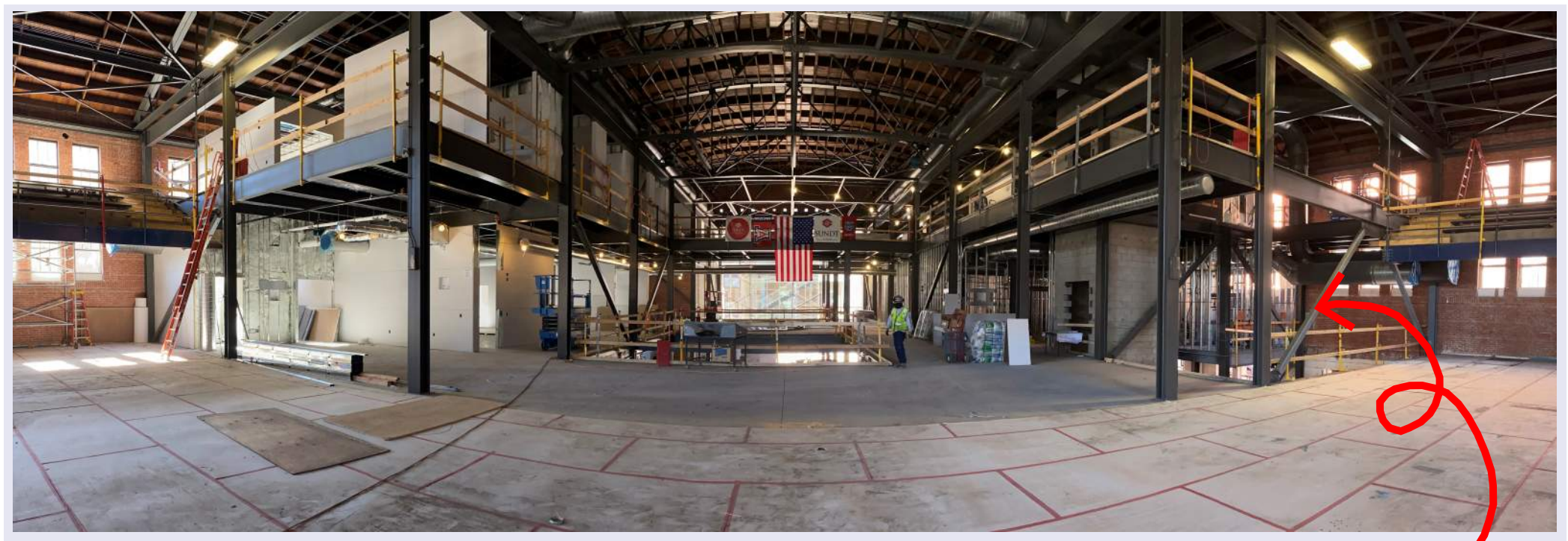
Inside the main entrance standing on the historic gym floor, looking south. Level 2 drywall is going in on top of insulation and in-wall mechanical, electrical, and plumbing systems.

Construction Update - Week of May 24, 2021