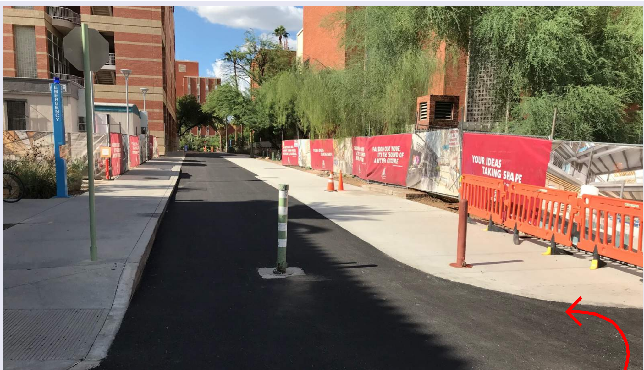
Between the Albert B. Weaver Science-Engineering Library and the Henry Koffler Chemistry Building, the team placed a new asphalt bike path last week before the students return to campus for the 2021 fall semester. It runs all the way from 4th St. to University Blvd.

Construction Update - Week of August 16th, 2021