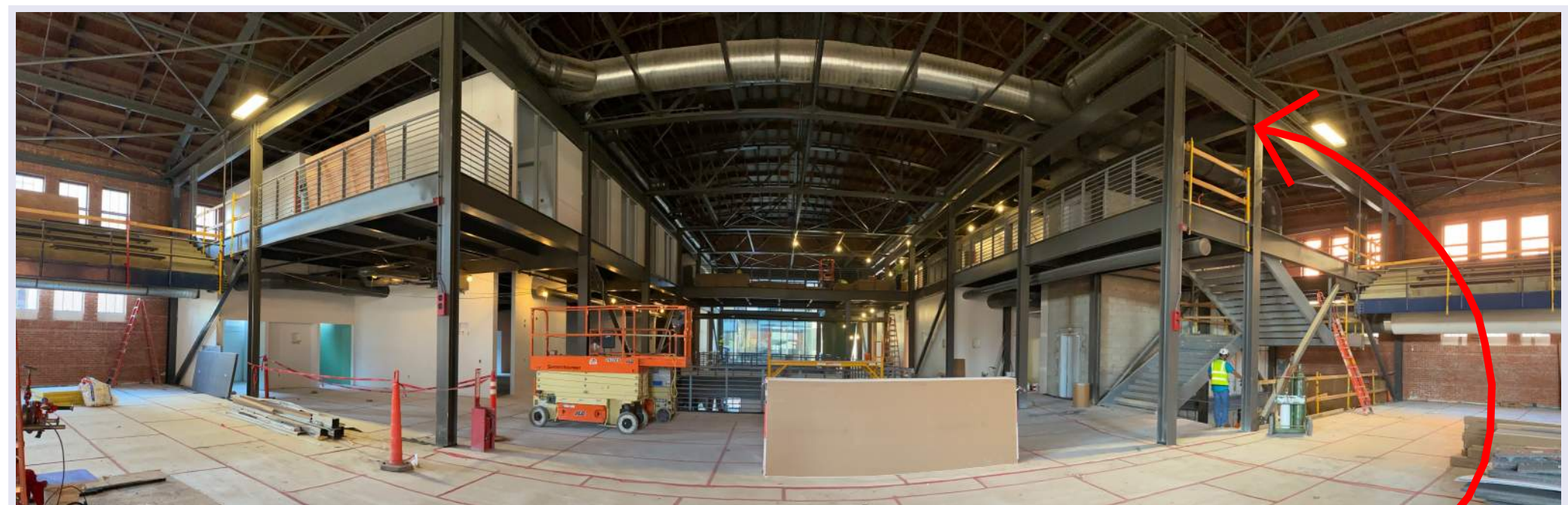
Inside the main entrance standing on the historic gym floor, looking south. Plumbing fixtures are going in on level 3, acoustical ceilings are getting installed on level 2, and walls are receiving tape and texture down on level 1.

Construction Update - Week of August 16th, 2021