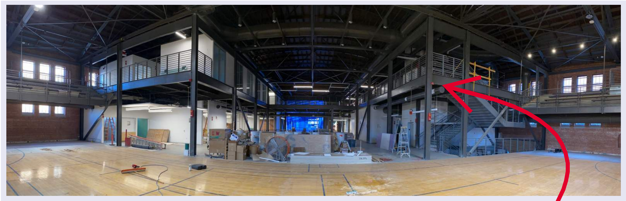
Inside the main entrance standing on the historic gym floor, looking south. Guardrail is installed on level 3. The historic gym floor on level 2 is being sanded. The concrete floors on level 1 are being polished.

Construction Update - Week of October 11th, 2021